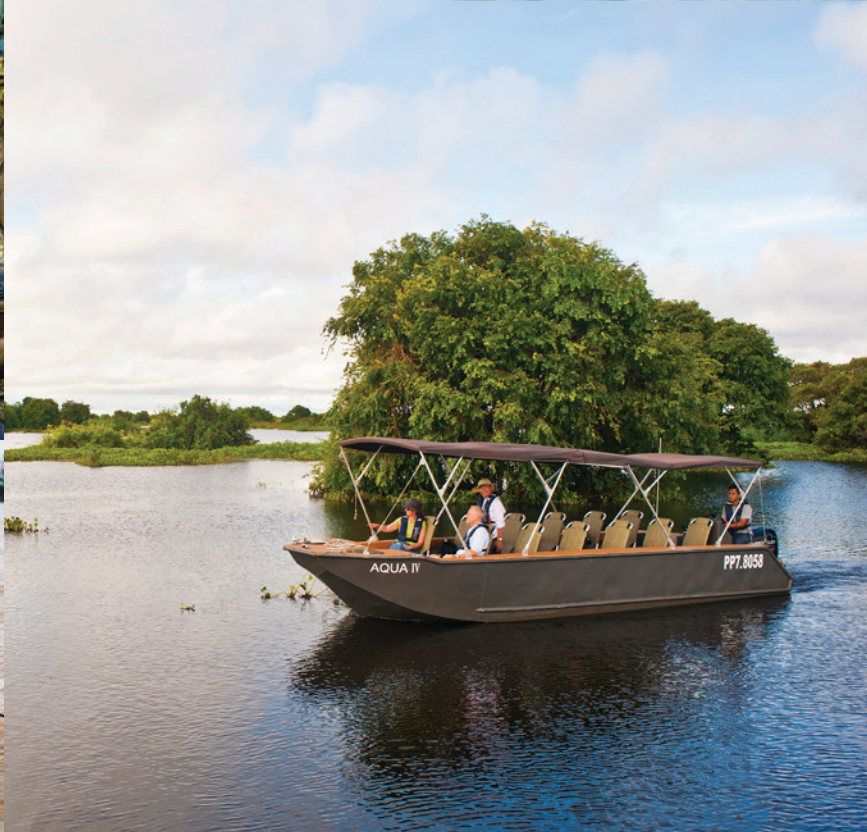
4 ergonomic private tenders for excursions