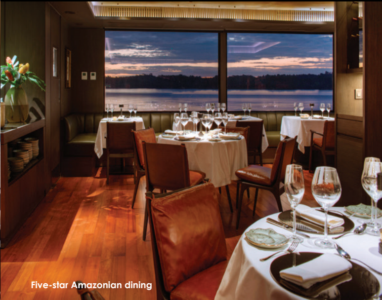
Five-star Amazonian dining