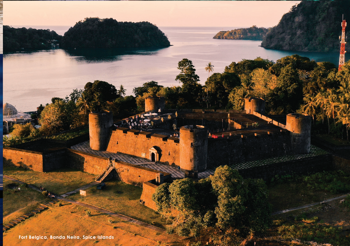
Fort Belgica, Banda Neira, Spice Islands