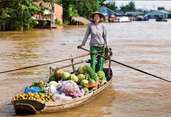
Local floating markets