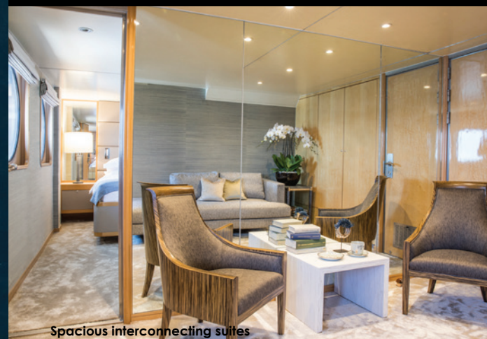
Spacious interconnecting suites