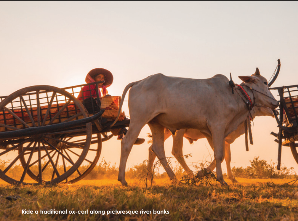
Ride a traditional ox-cart along picturesque river banks