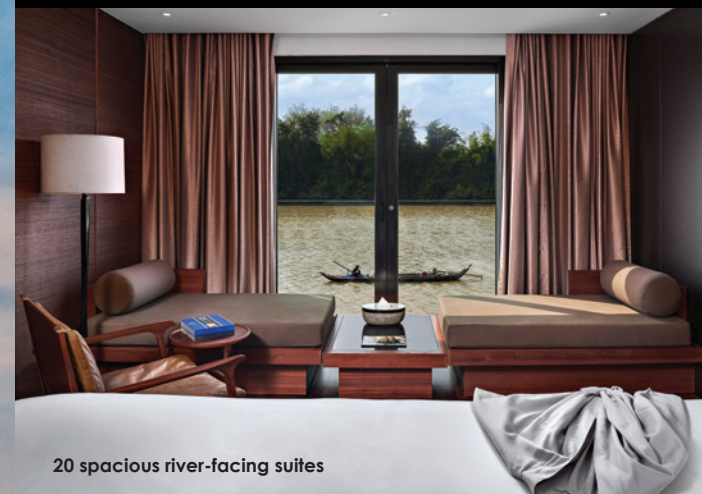
20 spacious river-facing suites