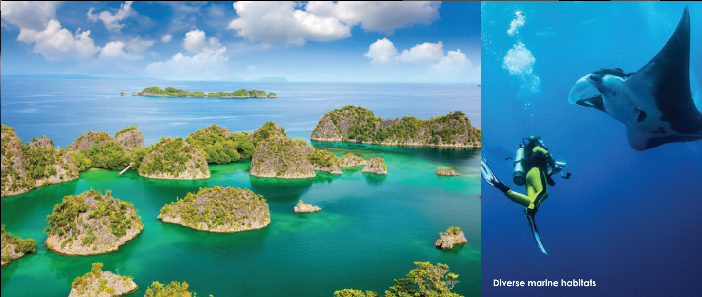
Diverse marine habitats

Discover paradise on the edge of the Pacific