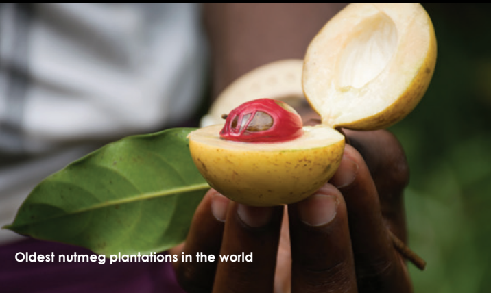
Oldest nutmeg plantations in the world