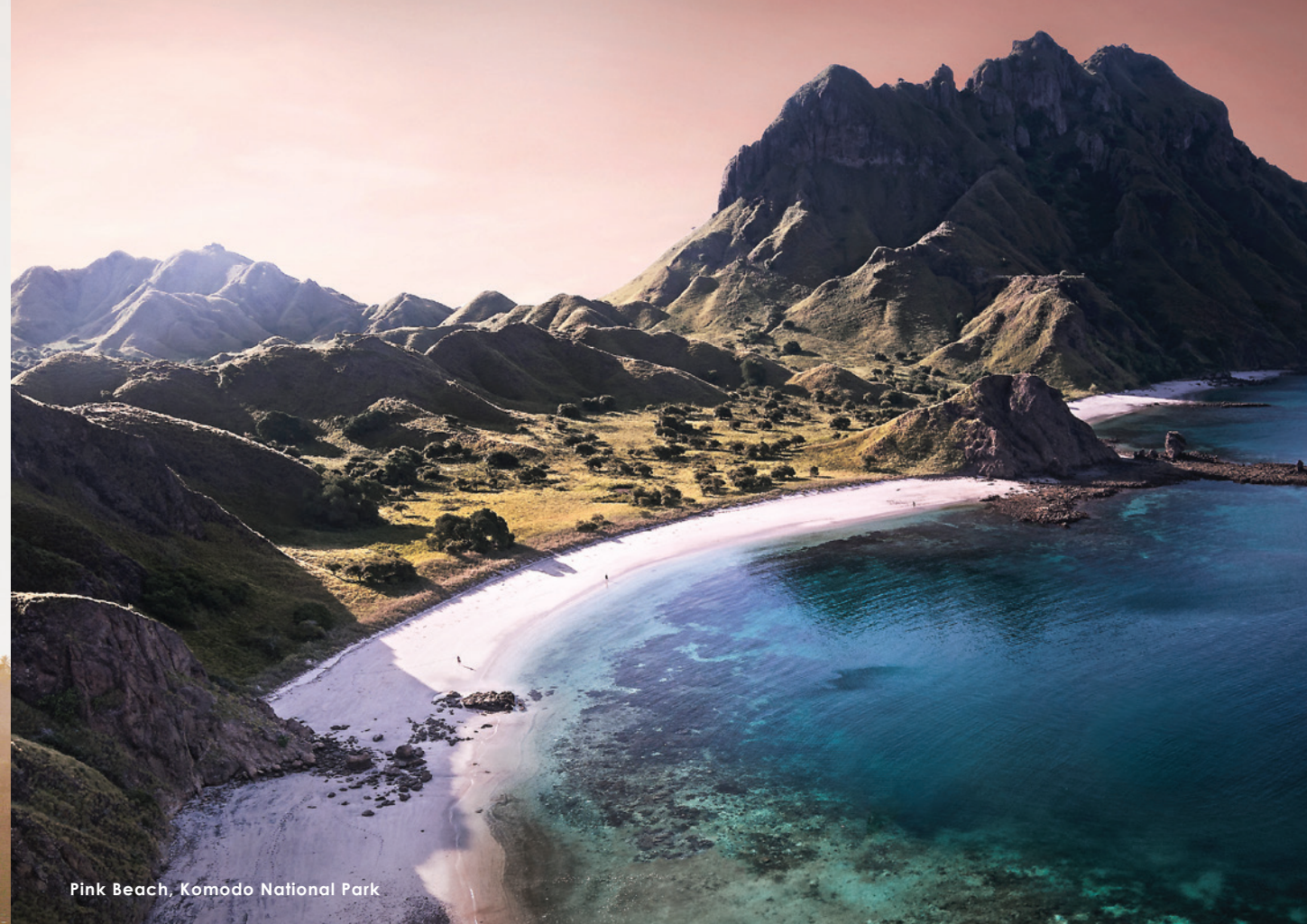
Pink Beach, Komodo National Park