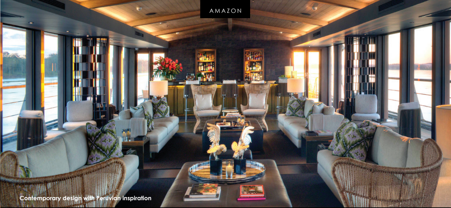
Contemporary design with Peruvian inspiration