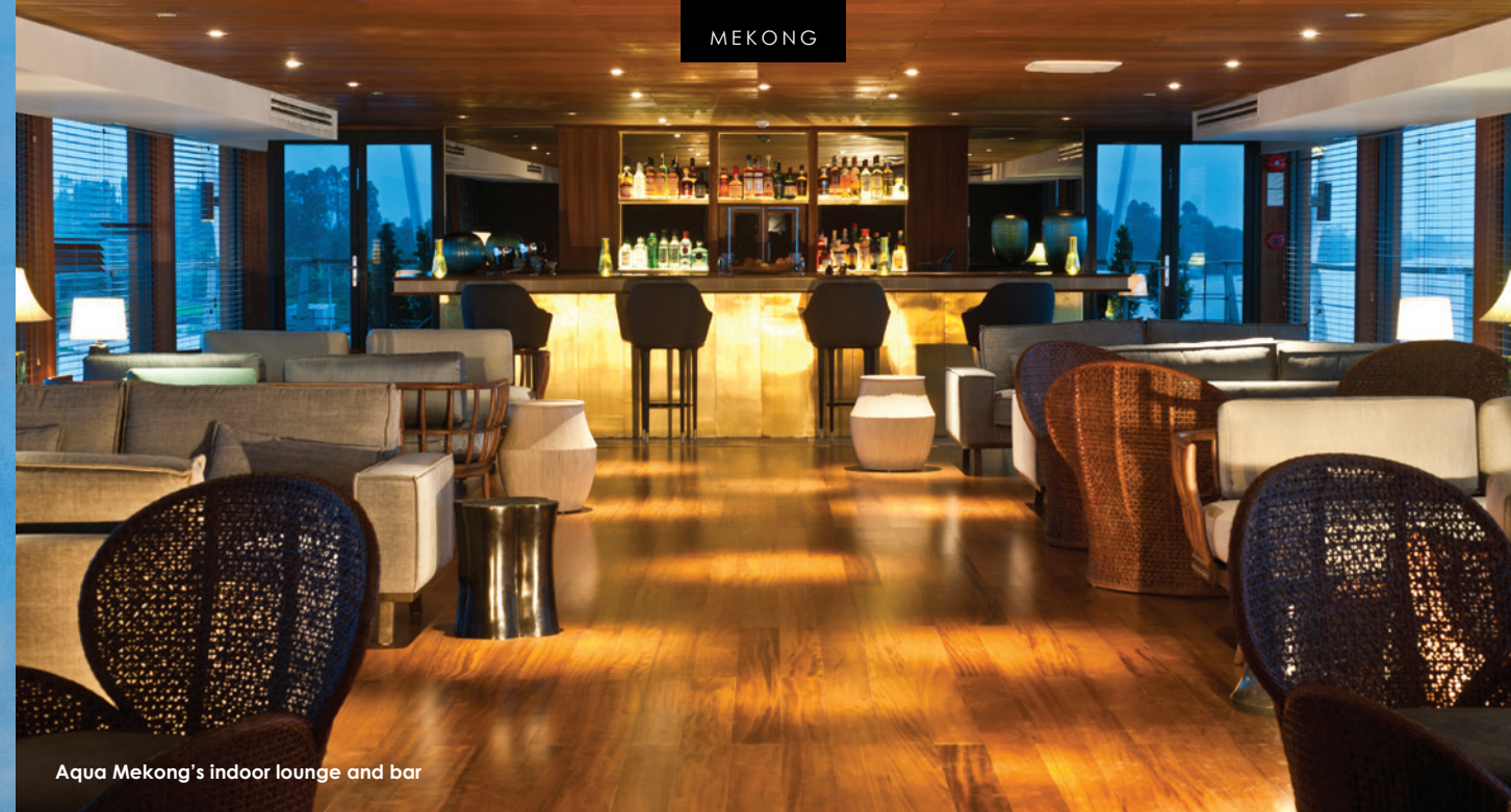
Aqua Mekong's indoor lounge and bar