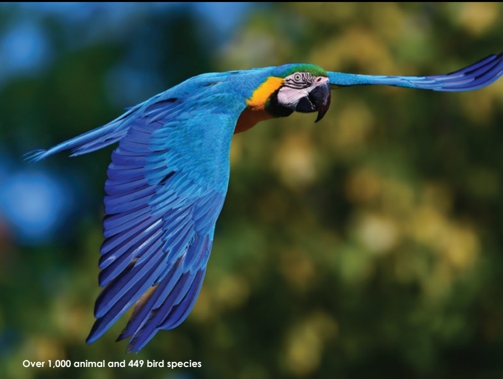
Over 1,000 animal and 449 bird species