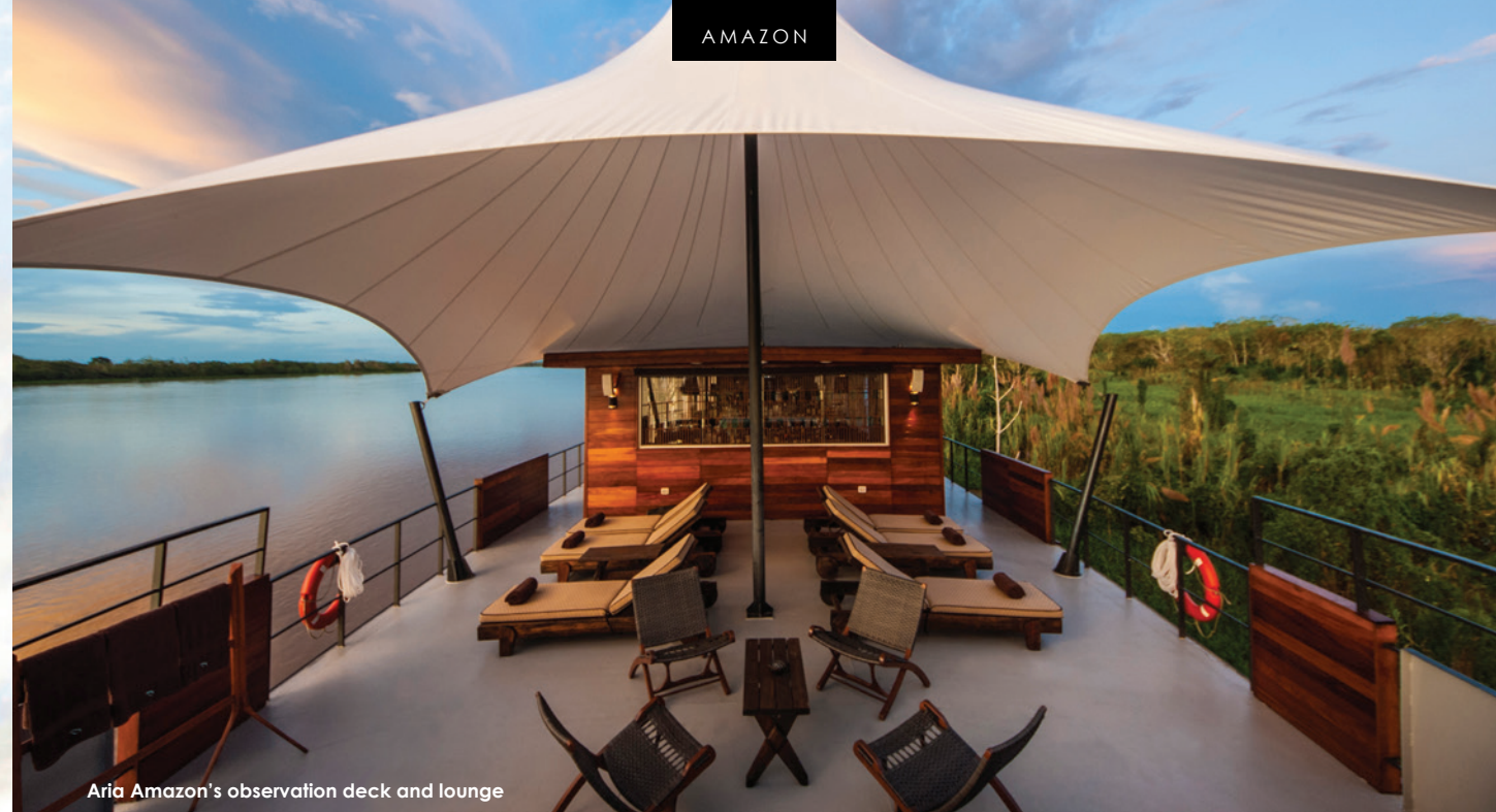
Aria Amazon's observation deck and lounge