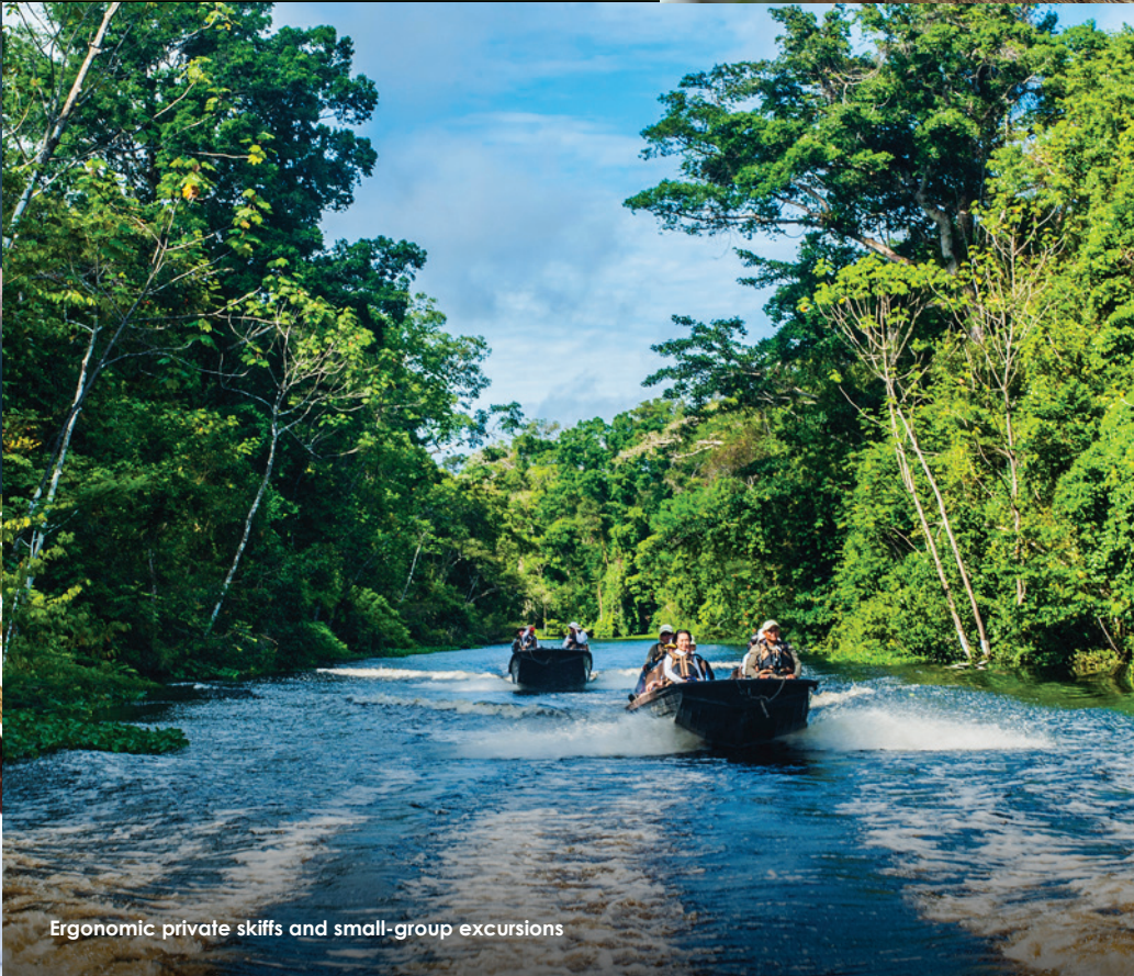
Ergonomic private skiffs and small-group excursions