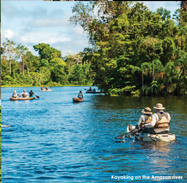
Kayaking on the Amazon river