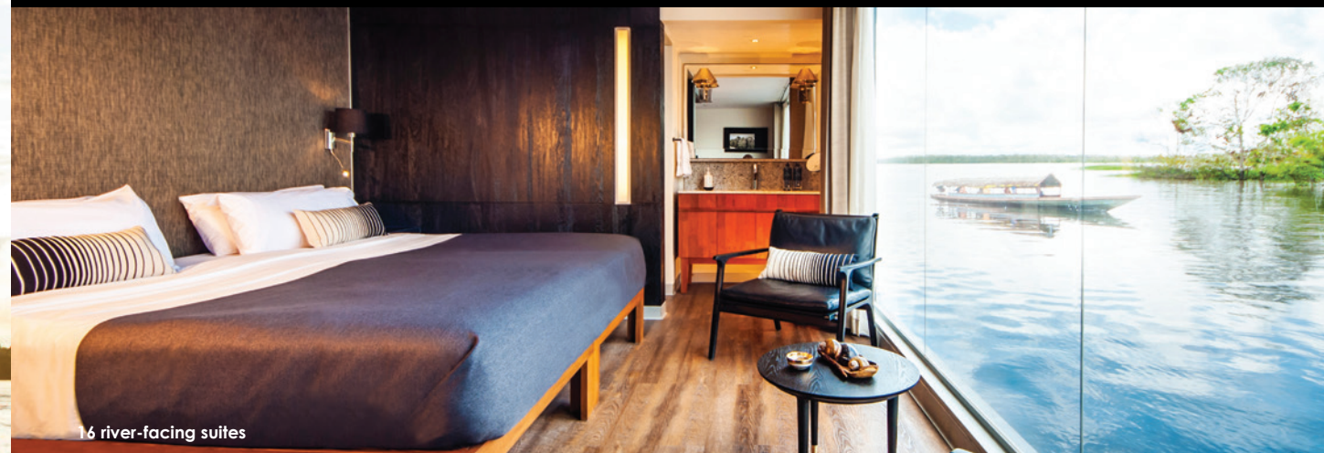
16 river-facing suites