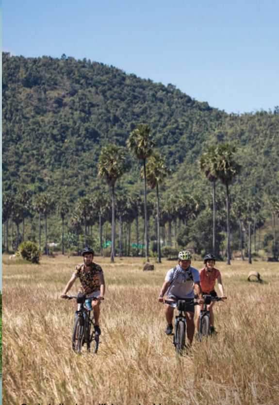
Cycle in the beautiful countryside