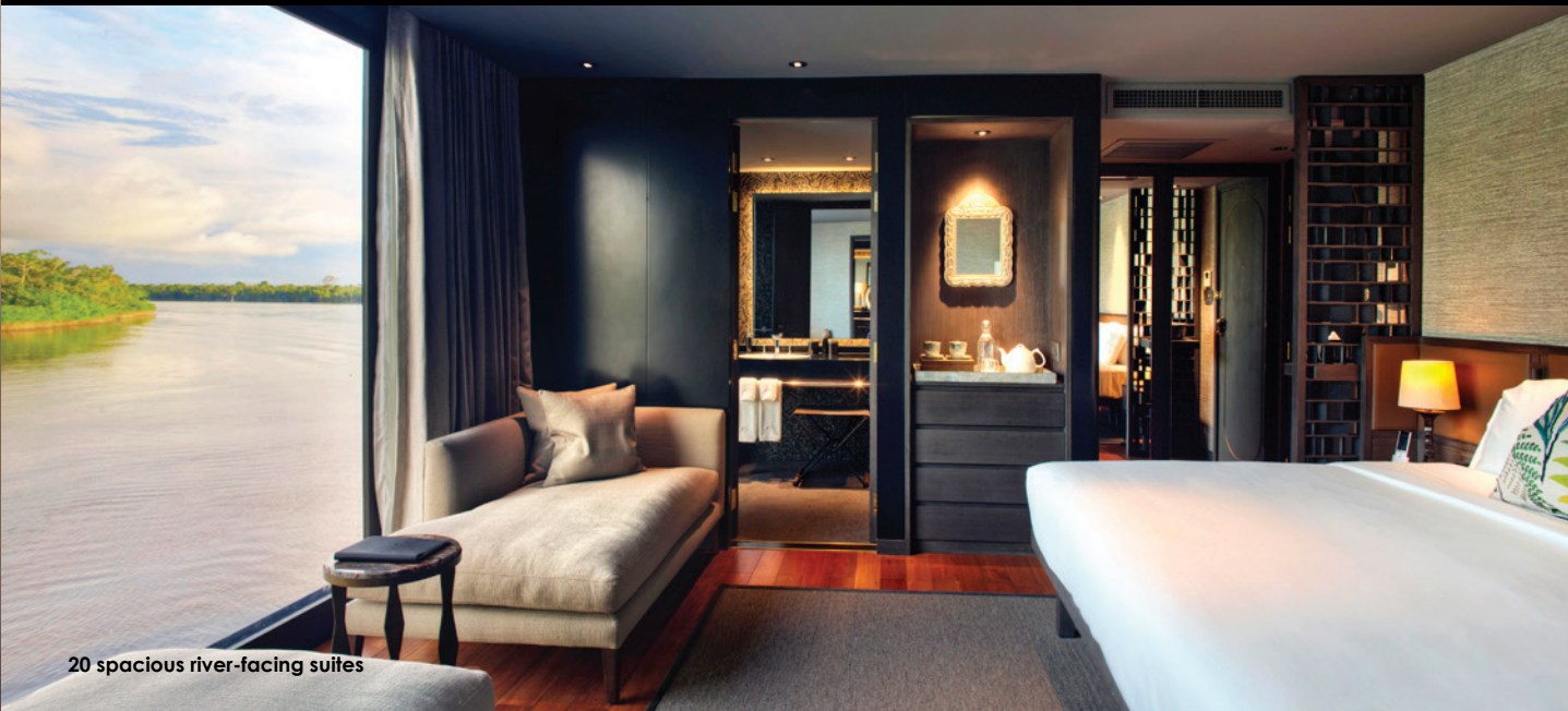
20 spacious river-facing suites