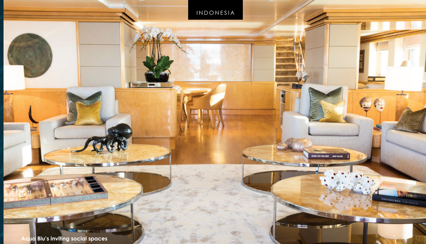
Aqua Blu's inviting social spaces