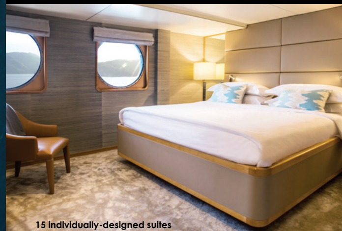
15 individually-designed suites